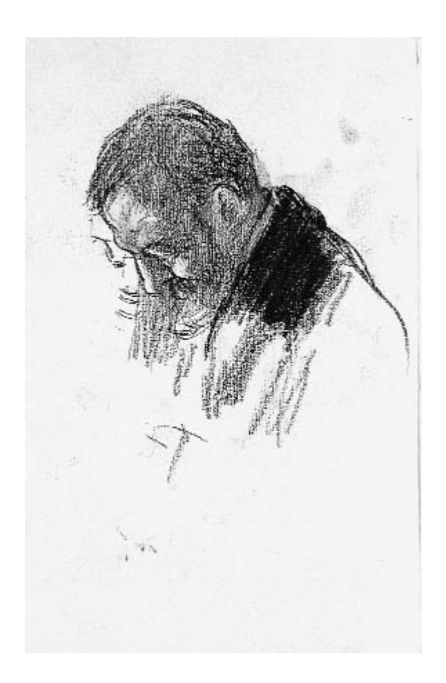
Figure 5. Joaquín Sorolla y Bastida. Preparatory sketch for A Research, 1897. Pencil on paper, 17 x 23.4 cm. Unsigned. (Simarro Legacy Trust, Fundación General, Complutense University).

Sorolla never sold A Research (1897, Sorolla Museum), which allowed him to win the laurels of honor awarded by the Salon, or The White Slave Trade (1895, Sorolla Museum), which had been presented two years before in Paris, and, upon the death of the painter, both pictures went directly to the assets of the future Sorolla Museum. The value of A Research for Sorolla is obvious because, in addition to