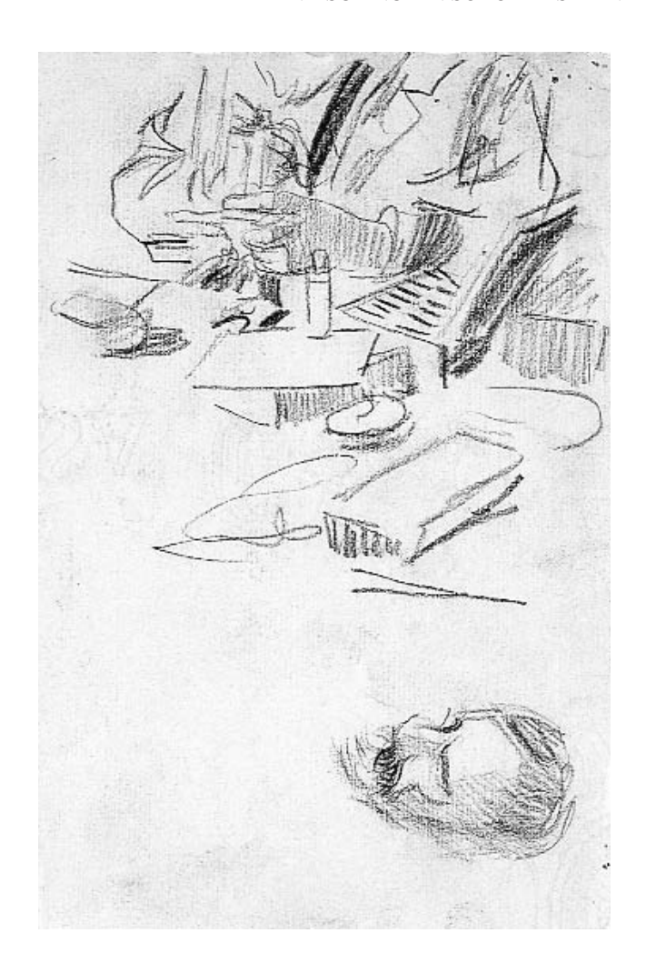
Figure 4. Joaquín Sorolla y Bastida. Preparatory sketch for Portrait of Dr. Simarro at the microscope, 1897. Pencil on paper, 17 x 23.4 cm. Unsigned. (Simarro Legacy Trust, Fundación General, Complutense University).