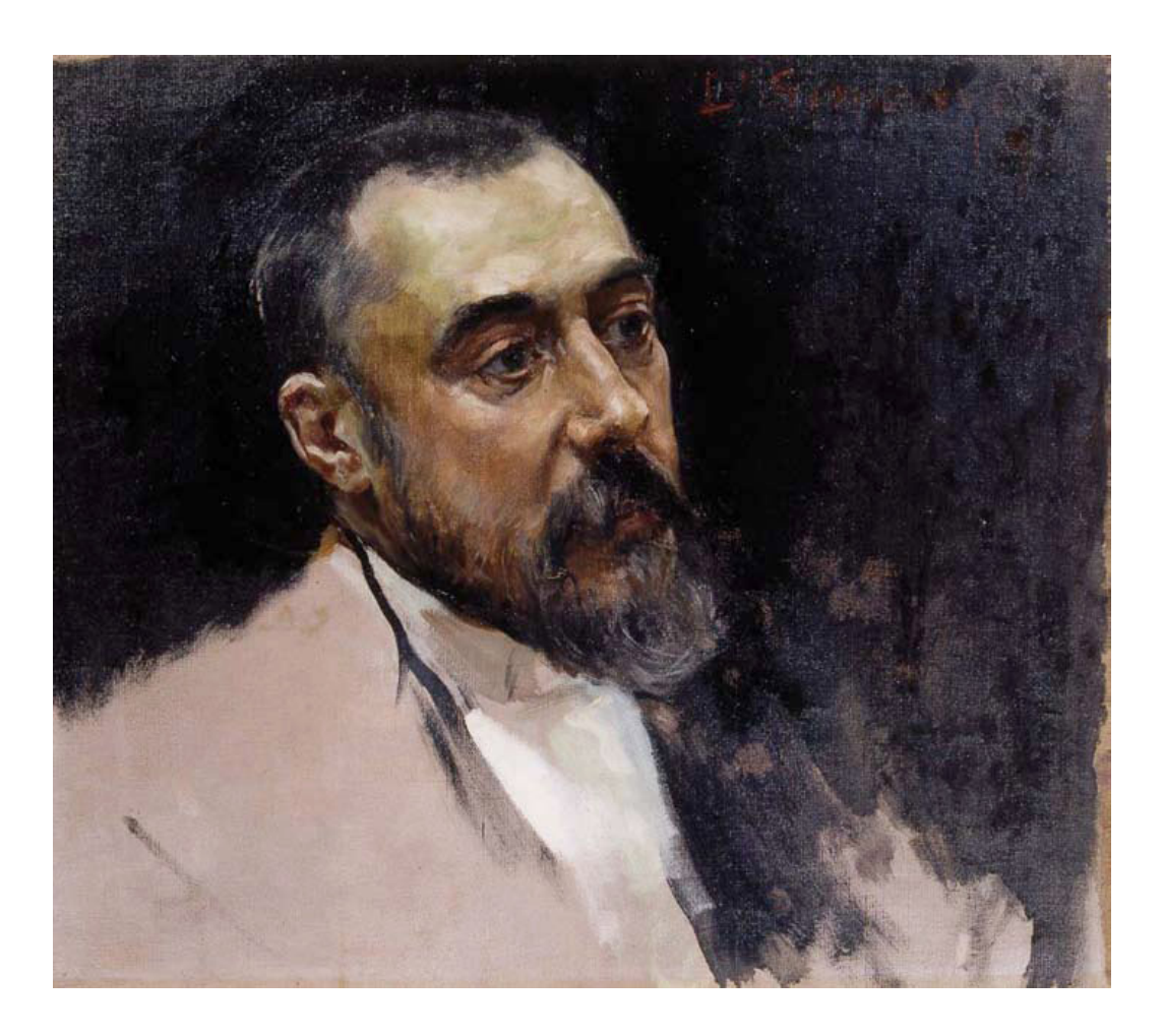
Figure 1. Joaquín Sorolla y Bastida. Simarro , 1896. Oil on canvas, 46 x 53 cm. Unfinished, unsigned, entitled and dated right upper corner: L. Simarro 1896. (Simarro Legacy Trust, Complutense University).

and disciples attentively watch the course of such an important scientific investigation. Both the figures and the myriad of objects that fill his work table are a marvel of color. Sorolla obtained six votes for the medal of honor in the last General Exhibition of Fine Arts for this painting (De Cuenca, 1897).